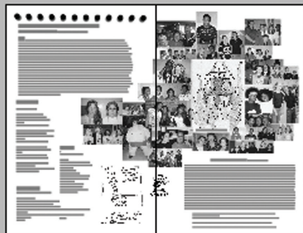
Pages 2 & 3