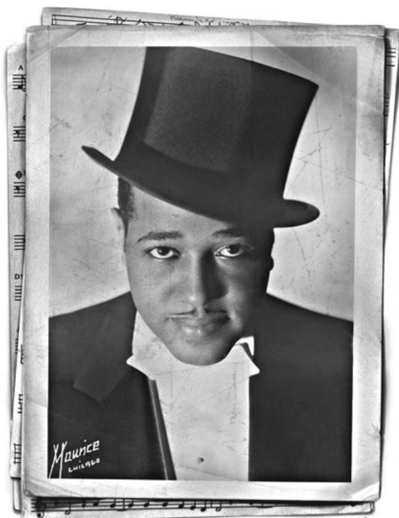
A piano player. A composer. An orchestra leader. Duke Ellington reigned over a land called Jazz.

and "Mood Indigo." By the time he was telling folks to "Take the 'A' Train," Duke Ellington and his orchestra were sitting on